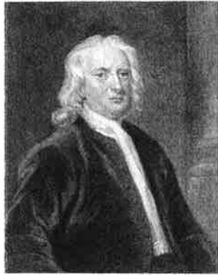
Sir Isaac Newton (1642–1727)

forces, including gravity and the changing forces caused by air currents. If you could analyze the forces individually, you'd find that each force affects the paper's motion in a simple, predictable way. Sir Isaac Newton (1642–1727) discovered the remarkably simple laws that govern motion.